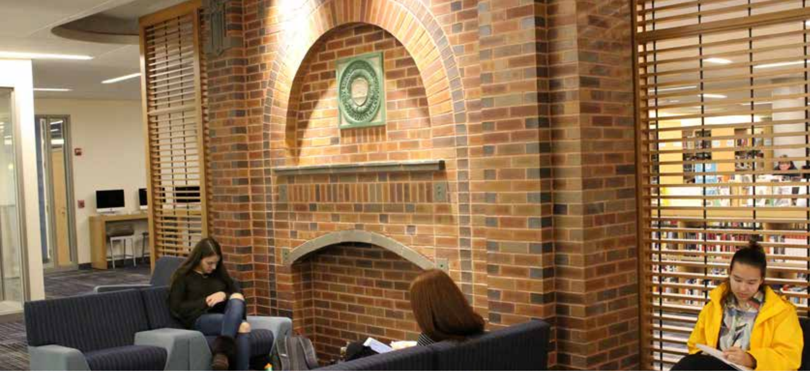
Above: Students study in front of a historic fireplace in the new library. Fixtures from the original 1912 fireplace were used to reconstruct it in the new building. Below left: Community members use the mast stair in the main concourse to tour the building during a public ribbon-cutting. Below right: The gathering staircase connects the new Student Commons to the Library Commons, both places for students to eat and study. Below: A new core academic classroom features dual projectors, flexible furniture, and ample natural light.